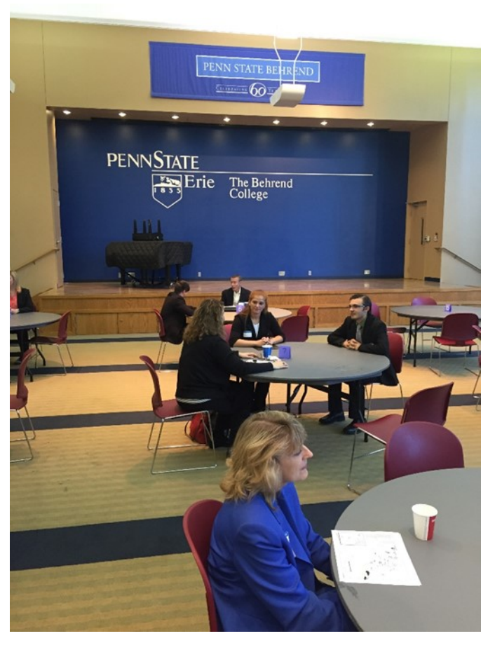
Students network with local professionals during the Business Blitz on September 23.