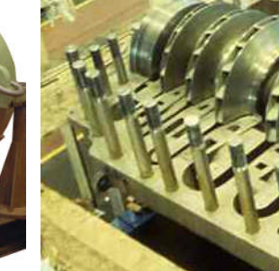
Barrel (or radially-split) compressor casing