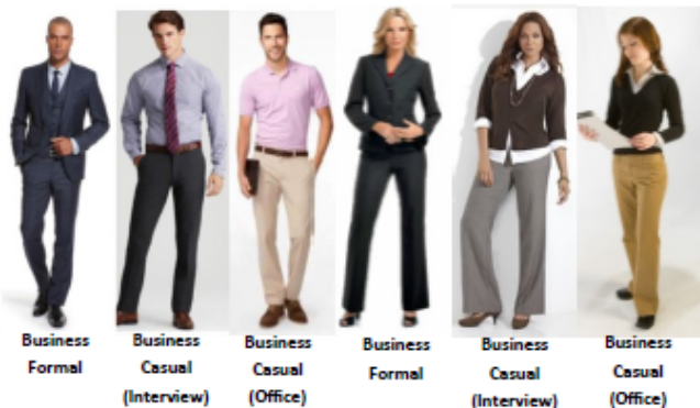
Business Formal Business Casual (Interview) Business Casual (Office) Business Formal Business Casual (Interview) Business Casual (Office)

The rule of thumb is that you dress one or two levels higher than the job that you're applying for.