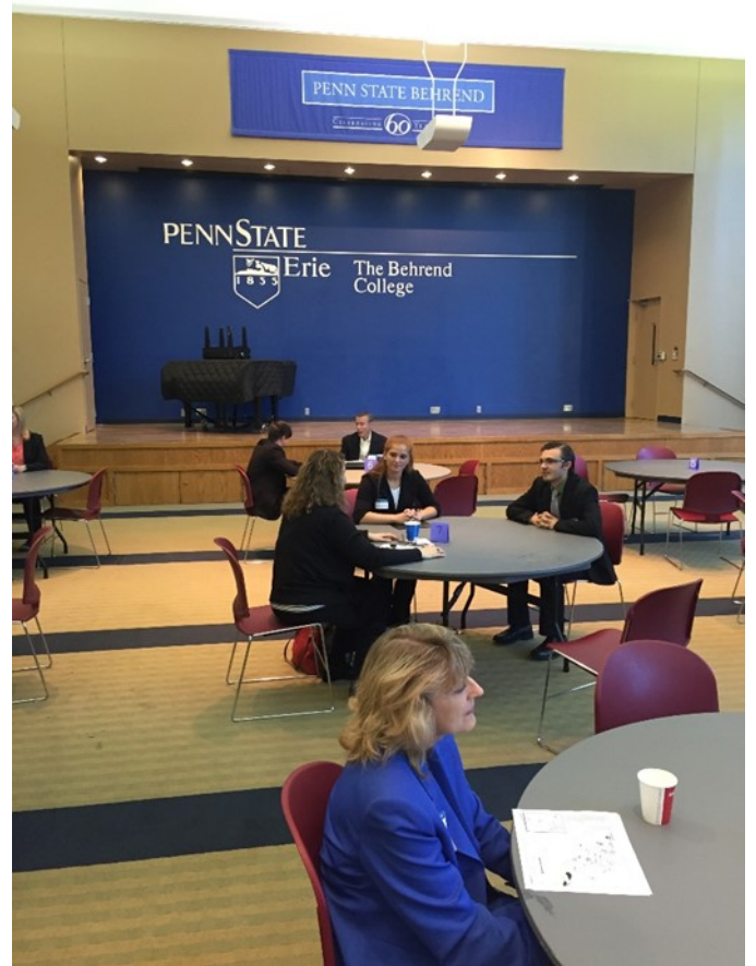
Students network with local professionals during the Business Blitz on September 23.